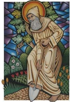
St. Fiacre Patron of Gardeners

CatholicCare has quickly adapted to social distancing laws, providing marriage education virtually from mid-March. If you are engaged and are planning on getting married soon, CatholicCare is still able to provide you with your marriage education course during this time. We expect demand to surge when social distancing rules are relaxed further, so don't miss out. Book now! Call 13 18 19.